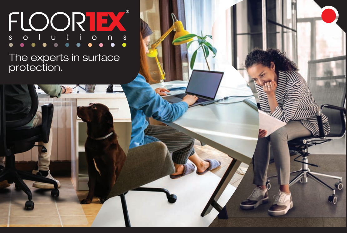
Damage prevention and ergonomic performance for the office, home office & home